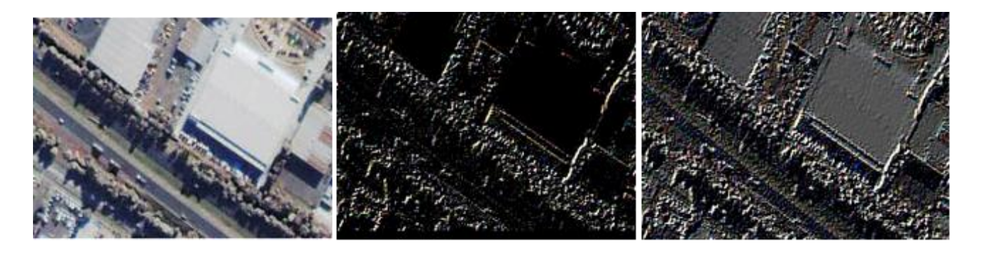
Fig. 2. Original image (left), difference image with perturbation matrix norm 0.05 (center), difference image with perturbation matrix norm 0.3 (right)

Fig. 1 (left) shows a space image containing mainly fractal images - fire centers in the taiga, framed by pseudo-regular boundaries. Fig. 2 (left) shows an image of a fragment of a city line containing approximately equivalent in amplitude low, medium and high SP modes. To the right are the difference images: "disturbed" minus the original one.