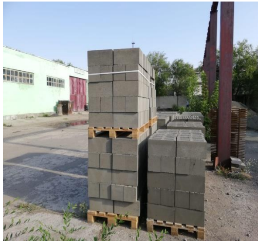
Figure 3. Hollow wall stone

In the research, moisture content was taken as the main parameter of the quality of industrial waste. Incoming control of the moisture content of man-made waste supplied to the enterprise is carried out on the basis of TU 34 4014-74 and recommendations for the use of bauxite slimes in concrete solutions [3-4]. The technological line for the production of construction products presented in Fig.4 allows the production of products of various construction assortments. Produced with the use of man-made waste with different moisture content, hollow wall stones were subjected to compression tests after 28 days, Fig.5 (as a traditional raw material used