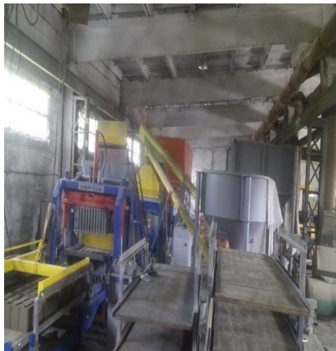
Figure 4. Technological waste production line for construction products

In the research, moisture content was taken as the main parameter of the quality of industrial waste. Incoming control of the moisture content of man-made waste supplied to the enterprise is carried out on the basis of TU 34 4014-74 and recommendations for the use of bauxite slimes in concrete solutions [3-4]. The technological line for the production of construction products presented in Fig.4 allows the production of products of various construction assortments. Produced with the use of man-made waste with different moisture content, hollow wall stones were subjected to compression tests after 28 days, Fig.5 (as a traditional raw material used