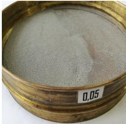
Figure 1. Flown ash

Man-made wastes used to replace traditional raw materials in the production of hollow wall stone are presented in Fig, 1-2 are by-products of the production of thermal stations and metallurgical enterprises of Pavlodar region.