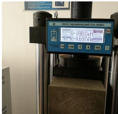
Figure 5. Compression test of hollow wall stone