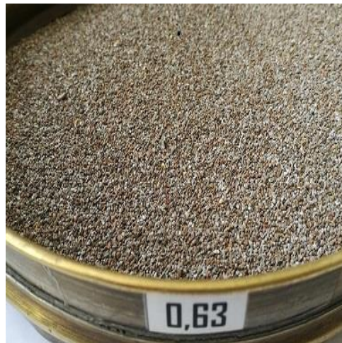
Figure 2. Bauxite sludge

Ekostroyinii-PV LLP produces construction products, including hollow wall stone with the addition of the above presented man-made waste into concrete mixtures as fillers Fig. 3.