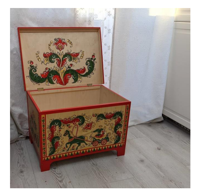
Fig. 1 "Festive chest" in the "Boretskaya" painting.

Keywords: Severodvinsk painting, technology, folk art, boretskaya.