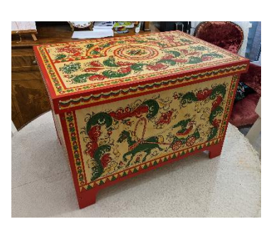
Fig. 11 Finished product.

The product is ready and will become a real functional decoration of any interior. (Fig. 11)