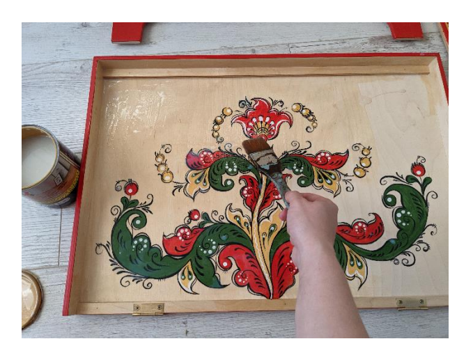
Fig. 9 Varnishing

Protects the product from moisture and scratches. A colorless matt varnish is used. (Fig. 9) The widest possible flute brush over the wood pattern without stopping. The coating is applied in layers, each layer must be dried about three times. After drying, the product is assembled. (Fig. 10).