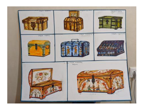
Fig. 2. Sketches of chests

The shape of the "Bench" chest is selected (Fig. 2.).