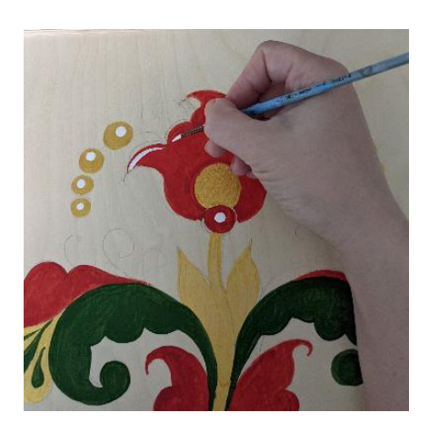
Fig. 7 Execution of the living Varnishing

Initially, apply all light colors, then darker ones, be sure to start reviving with whitewash (Fig. 7), finish the composition with contouring (Fig. 8), thin lines, circles, dashes, etc. black tempera. Select the brushes N_{2} 4, for the stroke -N_{2} 1. [4]