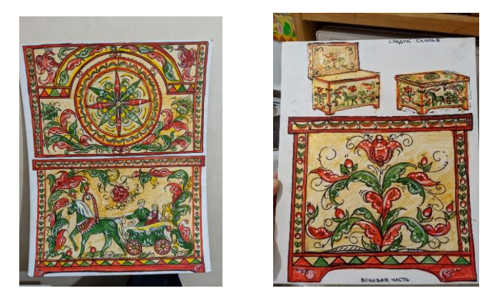
Fig.3 Compositions of borets painting "Rosette" "Tree" and "holiday skating"

Museum of Folk Artists, a book on color science. In compositions, everything depends on the shape of the object, the plot is selected based on this rule. In the composition, there is a symbiosis of nature and man is inherently present in every plot. The main symbol is a tree - a sign of human happiness.