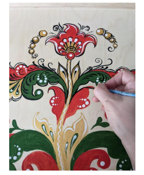
Fig. 8 execution of the Contouring