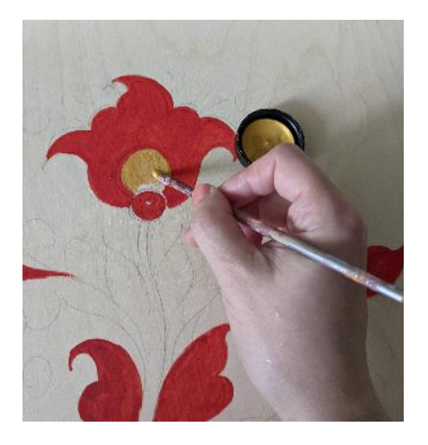
Fig 6. Application of painting

You need to fix the hand and completely relax the hand. Smooth strokes are applied with a bold slide of the hand, holding the brush with the little finger on the hand. (Fig. 6)