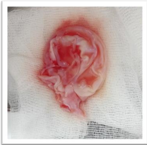
Fig 4. Macroscopic. Chitinova shell.

To verify the diagnosis, a histological study of the macro production was carried out, the conclusion-echinococcosis of the rib with suppuration. The postoperative period was carried out antiparasitic chemotherapy with Albezol 400 mg for 2 tablets per day, a course of three months with a break of 14 days between cycles; Antibiotic therapy, antihistamines, painkillers. The postoperative period proceeded smoothly, without complications. The soreness in the field of postoperative wound decreased significantly on the second day. If the patient is discharged from the hospital for 7 days, the test surveys of the abdominal ultrasound, chest radiography, craniography, showed the absence of any cystic formations. One month after the postoperative wound statement without features. Currently, the patient is under the supervision of a family physician at the place of residence.