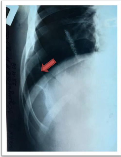
Fig.1. A targeted radiograph of the chest. On the radiograph of the right half of the chest, the deformation of the front segment VIII edges is determined, the cystoid enlightenment with dimensions of 2.0x1.0 cm and 3.0x1.5 cm (indicated by the arrow).

According to clinical, laboratory and instrumental data, the inclusion of pulmonary, pleural or closer lying muscular-intestinal structures was not observed in the process. After the preoperative preparation of the patient, in the position on the left side, a cut in the projection of VIII ribs with a length of about 5.0 cm. Macroscopic: VIII periosteum ribs thinned, the structure of the bone fragile, the presence of cavities. When attempting resection of the rib, in the field of cystic expansion, along the inner wall of VIII edges, echinococcal brushes with chitinic shells and with child cysts were found. Numerous daughter cysts were removed. The cavity is repeatedly processed by glycerol, hypertensive solution and formalin 1% in the amount of 200 ml. Produced under the supervisory resection of the front cut VIII rib.