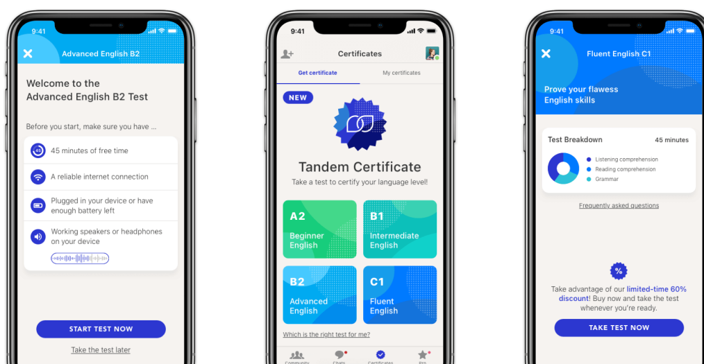
Figure 2: Screenshots of the Tandem application

language exchange partner, who is ideally a native speaker of the language you want to learn. Through a two-way process of direct communication and conversation, both learners are given the opportunity to improve their target language skills and proficiency while simultaneously fostering intercultural competence [8]. Moreover they introduced Tandem languages certificate. It helps members verify their English language level. The Tandem Tests have been carefully designed to correspond with the levels in the Common European Framework of Reference (CEFR), an internationally recognized system for learning languages established by the Council of Europe. Tandem currently offers four tests to examine English level proficiency: A2 (Beginner), B1 (Intermediate), B2 (Advanced), and C1 (Fluent) [9].