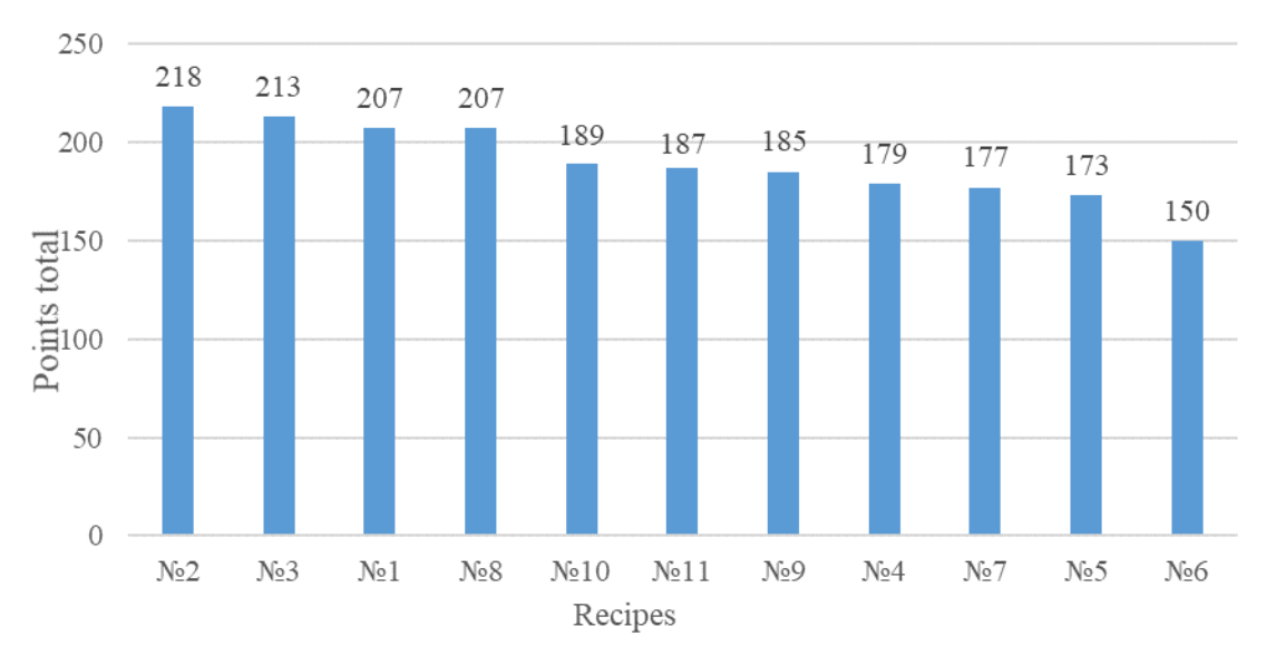
Figure 3 – AC recipe sum scores in descending order

Figure 3 shows a diagram with the values of the sum of the AC recipe scores in descending order (tested with oil from the Bashkirian stage of the field N_{2} 3).